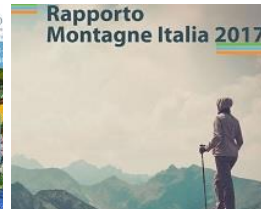
2017 Italian Mountains Report launched

The Centre for Mountain Ecosystem Studies, together with the Kunming Institute of Botany, Chinese Academy of Sciences and World Agroforestry Centre would like to invite contributions for the