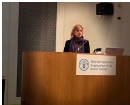
Mountains and cities, rural-urban dynamics

On 5–8 February 2017, the Food and Agriculture Organization of the United Nations (FAO) headquarters in Rome, Italy, hosted a workshop on rural-urban dynamics. The workshop “Feeding the