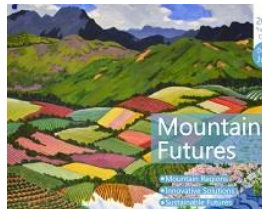
Mountain Futures calls for abstracts

On 5–8 February 2017, the Food and Agriculture Organization of the United Nations (FAO) headquarters in Rome, Italy, hosted a workshop on rural-urban dynamics. The workshop “Feeding the