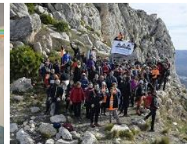
IMD celebrated in over 35 countries in 2017

The Rapporto Montagne Italia 2017 (2017 Italian Mountains Report) was presented on 30 January 2018 in the House of Commons in Rome. Now in its third edition, the report is produced annually by